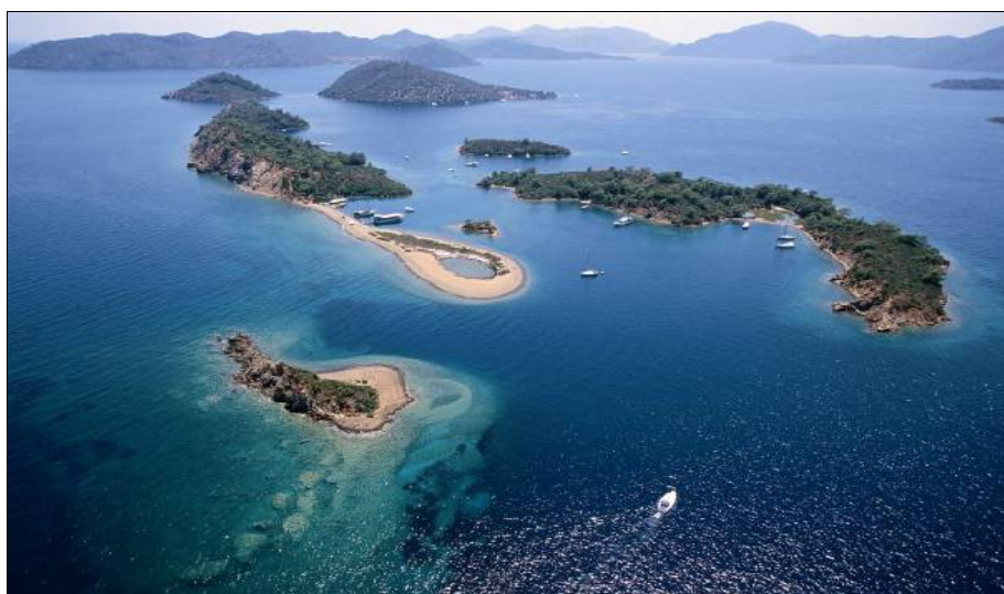
les 12 îles, baie de Göcek, Fethiye