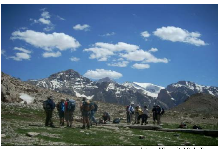
plateau d'Eznevit, Mt du Taurus