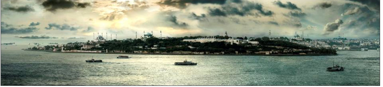
Istanbul depuis le Bosphore